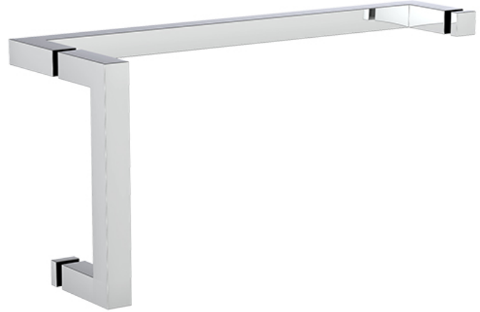
Offset Door Handle Shown with no Rosette